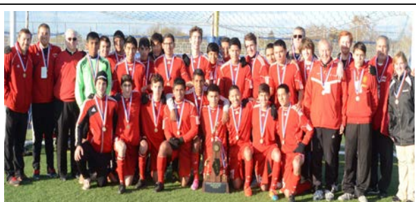
2014 - 2ND PLACE ILLINOIS STATE TOURNAMENT (23-1-1)